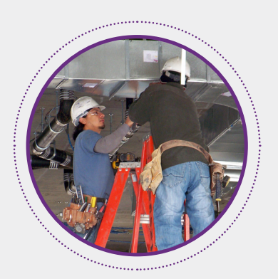
HVAC / AC DUCT INSTALLATIONS